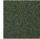
Solid Dark Green