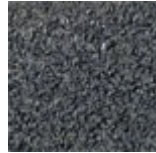
Solid Dark Grey